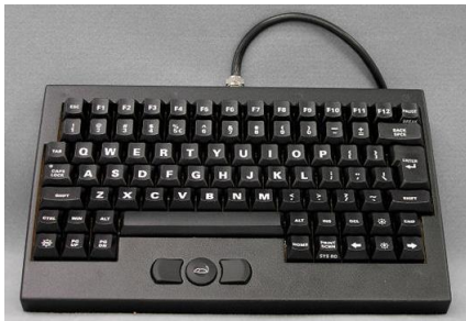
Table Top Model 84 with small Force button

Many options and configurations are available – mounting options include table top (with or without feet for bolt down applications) or mounting flange for top panel installation. The Model 84 can be ordered with or without an integral pointing device and/or USB hub for easy integration into your host system.