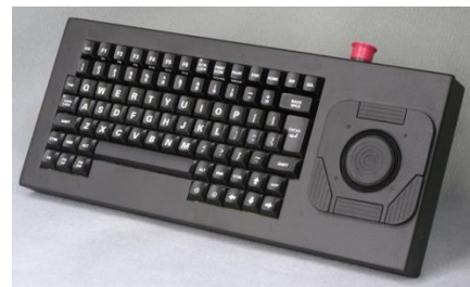
Bolt down Model 84 with DuraPuck pointing device