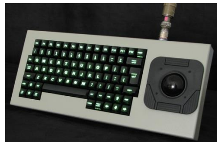
Table top with 2" Duratrack trackball