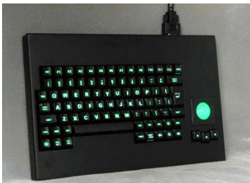
Table Top Model 84 with 1 3/8 trackball

Sealed rain proof, spill proof/sand and dust proof (IP65 and MIL-STD-810) construction EMI/RFI/ESD/EMP shielded and protected for critical applications Optional Extreme High Shock Protection (+100gs): Includes shock sensing (Stop Codes) and keycap clips as well as other options