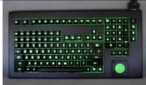
Table Top, 1 3/8" trackball, green backlit keys and ball, bulkhead d-sub