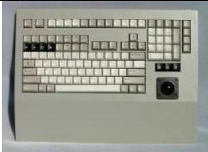
Rack Mount, 1 3/8" Trackball, Panel Mount, non-backlit with wrist rest, bulkhead d-sub

Various Keyboard options and configurations include, but are not limited to the following production examples. We've manufactured over 500 different Model 121 configurations, so chances are we already have a product that meets your needs.