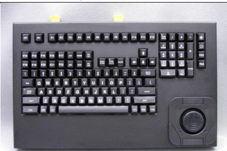
Table Top, DuraPuck, green backlit keys, dual bulkhead MIL connector