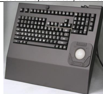
Rack mount, 2" Duratrack trackball, red backlit keys and ball, custom attached cable