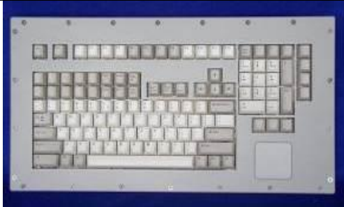
Panel Mount, touch pad, non-backlit, Bulkhead s-sub