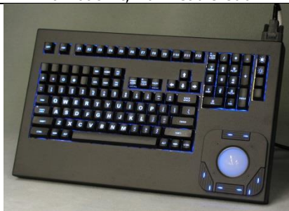
Table Top, 2" Duratrack trackball, blue backlit keys and ball, bulkhead d-sub