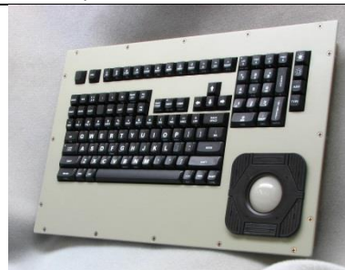
Panel Mount, 2" Duratrack trackball w/ 6 button bezel, red backlit keys and ball, bulkhead d-sub