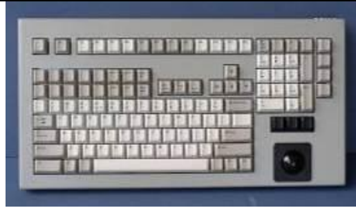
Table Top, 1 3/8 trackball, non-backlit, bulkhead d-sub