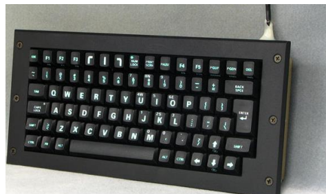
Model 79 with integral, removable cover and 1" trackball

Many options and configurations are available – mounting options include table top (with or without feet for bolt down applications) or top mount flange designs. The Model 62 can be ordered with or without an integral pointing device for a complete, compact data entry solution.