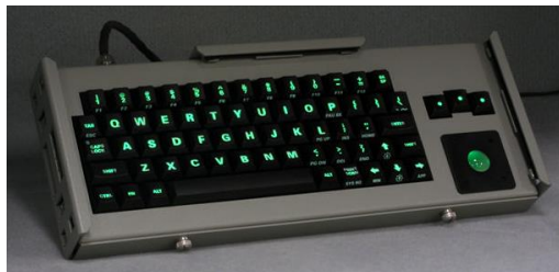
Rack Mount Model 62 with green backlighting

Optional Extreme High Shock Protection (+100gs): Includes shock sensing (Stop Codes) and keycap clips as well as other options