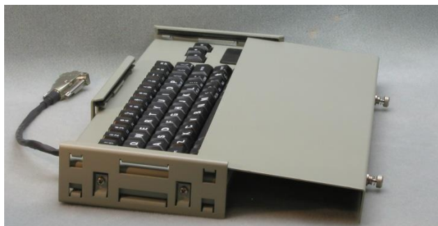
Model 62 with integral, removable cover and 1" trackball

Many options and configurations are available – mounting options include table top (with or without feet for bolt down applications) or mounting in keyboard trays with integral / removable covers. The Model 62 can be ordered with or without an integral pointing device for a complete, compact data entry solution.